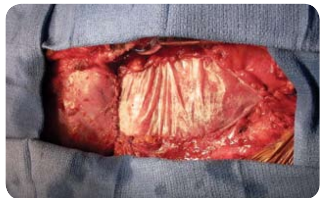
The LVAD is completely covered by the ECM utilizing the required circumferential closure technique with a running 4-0 Prolene.